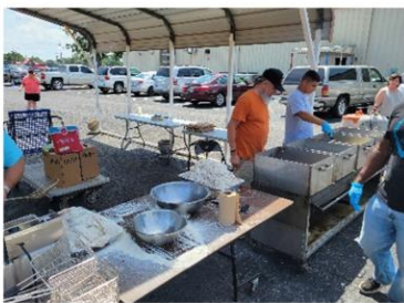
Early Bird Membership Drive and Fish Fry.