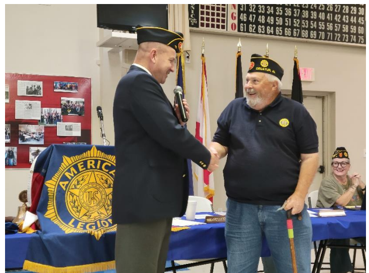
Post 15 Commander recognizes members for continued membership with The American Legion.