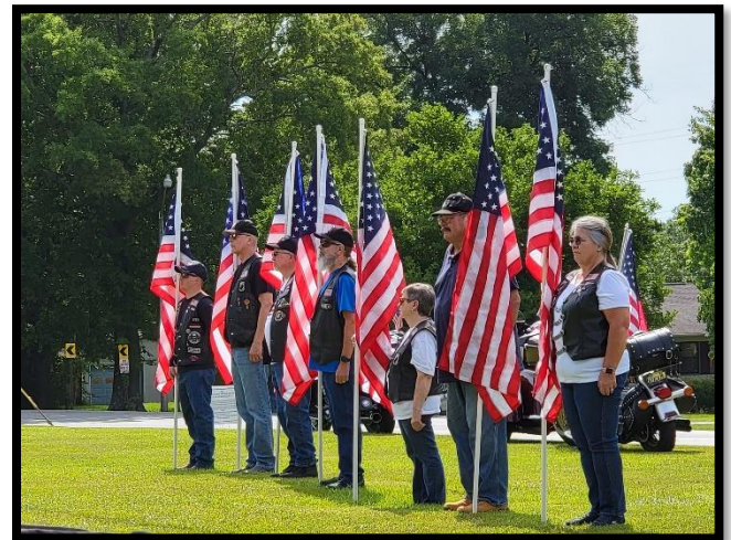
Morgan County Purple Heart Ceremony