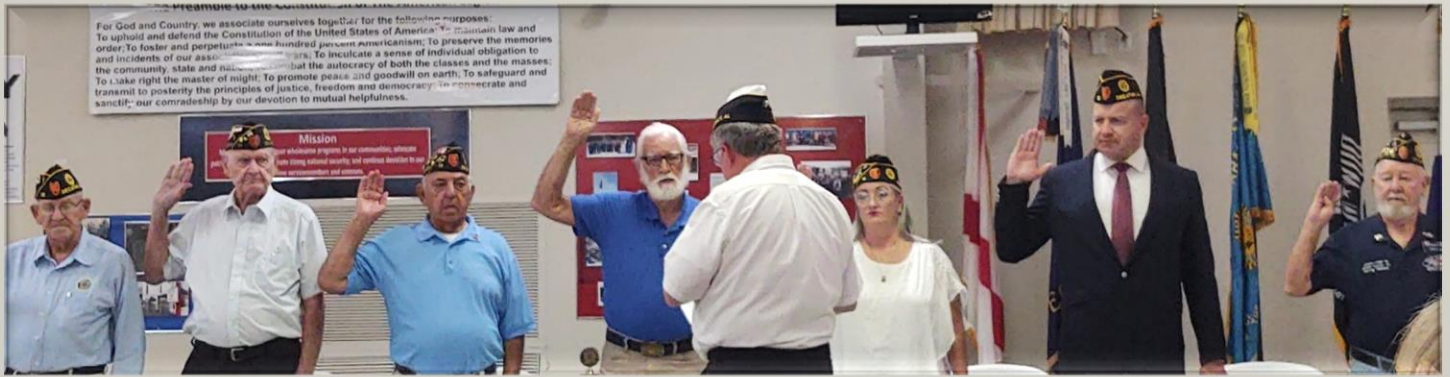
22-23 Officer Induction Ceremony