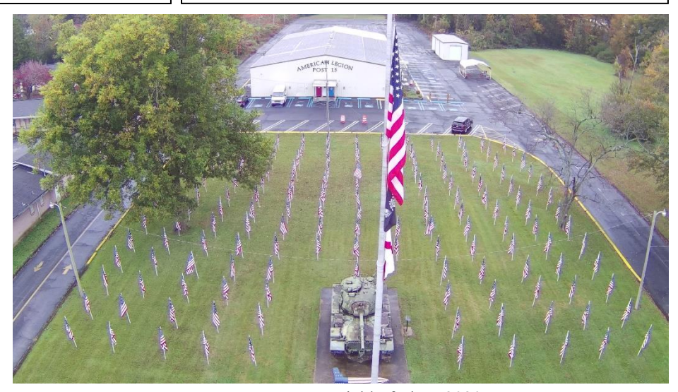
Veteran's Day Field of Flags 2020