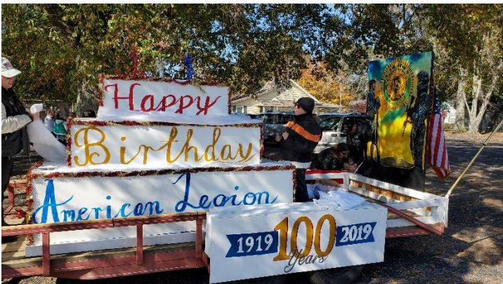
The Post 15 Veterans Day float won 1st Place and was displayed in Hartselle and Priceville parades.