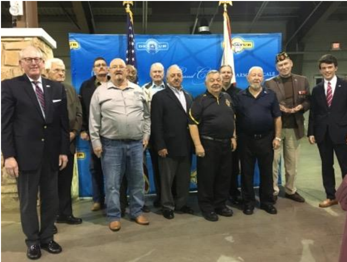
The Post 15 Honor Guard was recognized by Decatur City for their many contributions of honoring Veterans.