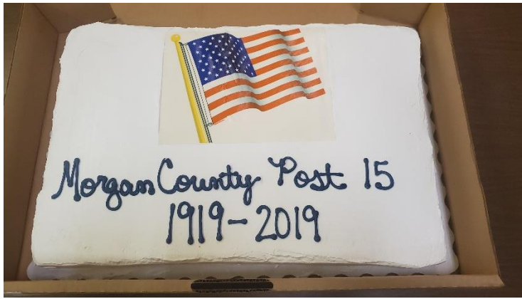
Post 15 Celebrated the American Legion's 100 year anniversary in Morgan County with cake and ice cream.